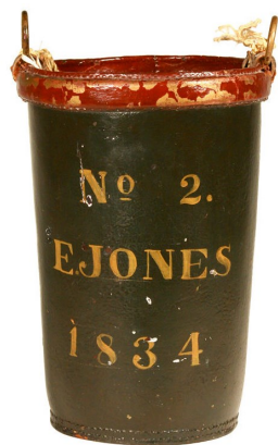
1834 fire bucket marked in the manner proscribed by the Alexandria Relief Fire Company.

created at the time of the town’s founding stated that homes could not have wooden chimneys, and if one was built the sheriff for the “County of Fairfax” would have it pulled down.