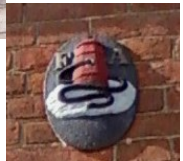
Various fire marks around Old Town Alexandria, most likely dating to the 20th-century.